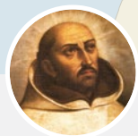
St John of the Cross